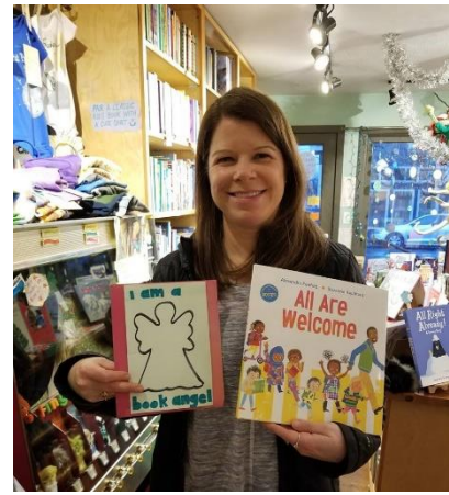
Look at all of those book angels! Thank-you!